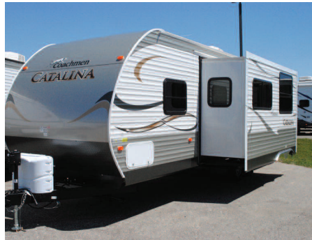
New 2014 Catalina 293DDS Travel Trailer

AS LOW AS $163 A MONTH SALEPRICE $19,995 SAVE $9,715