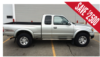
2003 TOYOTA TACOMA TRD 4X4 $10,595