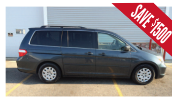
2005 HONDA ODYSSEY LIMITED $895