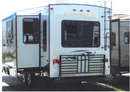
New 2014 Chaparral 25IKS Fifth Wheel

Kitchen slide with refrigerator, 3 burner range with microwave oven, as well as a stylish kitchen island featuring a double sink making dishes a breeze. Large picture window perfect for watching sunsets with that special someone. The slide out opposite the kitchen features a large U-shaped dinette and wardrobe with outside storage. Head up the steps to the front master bedroom and bath. The bath features a step in shower, toilet and sink. The master suite features a slide out wardrobe as well as a walk around queen mattress for easy access. This camper is absolutely ideal for couples. MSRP $43,184.