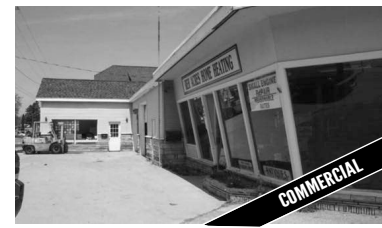
437 BOYNE AVENUE, BOYNE CITY This Commercial building has approximately 1641 sq ft for showroom and 2443 sq ft of warehouse space. MLS 440741. Ask for Holly Nierman. $159,000