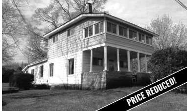
1009 WATER, EAST JORDAN Nice home on the edge of East Jordan, Two car detached garage, Paved drive. Large lot with lots of room for the kids to play. MLS 438945. Ask for Chris Oliver. $74,500