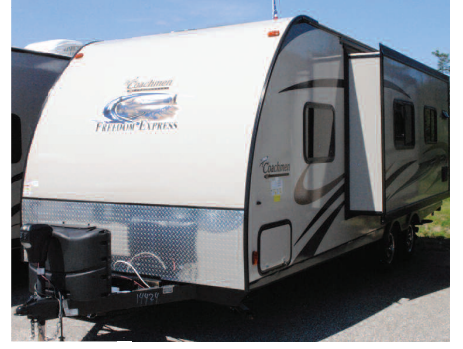
New 2014 Freedom Express 242RBS

WITH 122 UNITS IN STOCK WE HAVE THE LARGEST SELECTION OF ANY RV DEALER IN THE NORTH.