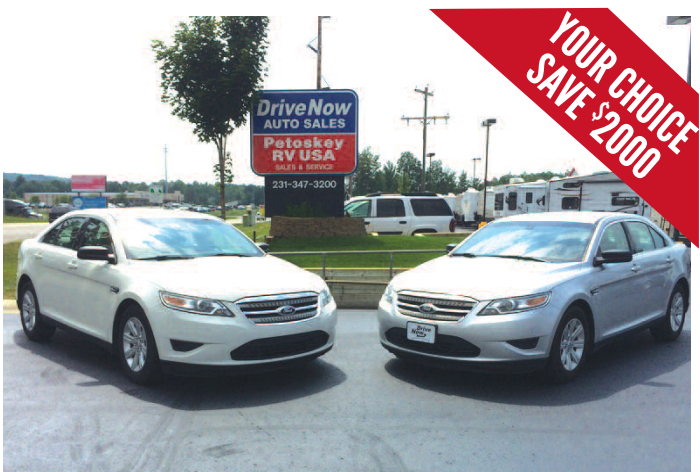
2011 FORD TAURUS - YOUR CHOICE - $13,495