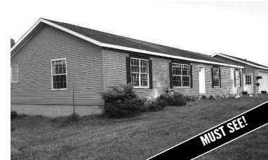
7890 BURGESS ROAD, CHARLEVOIX Picturesque country setting and centrally located to Charlevoix, Boyne City and Petoskey. MLS 439512. Ask for Jennifer Burr. $126,900