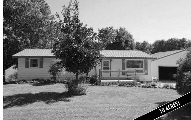
4468 E OLD STATE, EAST JORDAN • $79,900 Nice country home close to State land with great views from the full length deck on the back of the home. Home has four garage stalls. Lots of room for the kids and toys on this 10 acre parcel. A lot of room to add your own touches in the full basement. MLS 441399. Ask for Chris Oliver.