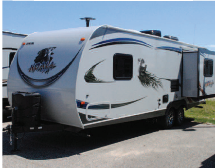
New 2014 Koala 23CS Travel Trailer

AS LOW AS $155 A MONTH SALEPRICE $18,995 SAVE $11,285