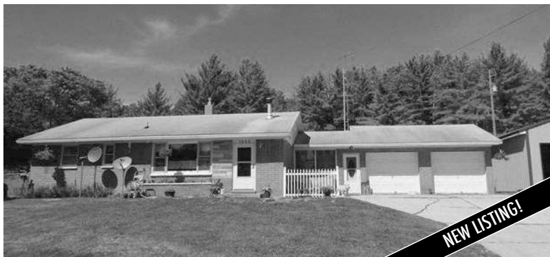
1962 W OLD STATE, EAST JORDAN • $127,900 Charming country home with lots of country appeal and room to play, wildlife all around. A nice pond at the edge of the yard for evenings of fishing panfish or listening to the frogs. Property offers a detached garage for the toys a shed for storage and concrete is poured for a 40 x 64 pole barn. A fenced back yard for the kids or dogs. Centrally located between East Jordan, Bellaire and Central Lake. MLS 441492. Ask for Chris Oliver

109 Mill Street • East Jordan • 231-536-7700