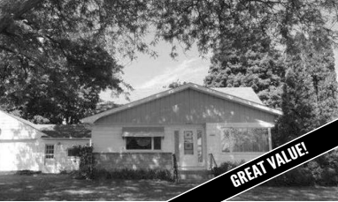
10445 PEEBLES • ELLSWORTH Home features a full basement as well as an attached garage for your storage. Great updates already in place. Ask for Jennifer Burr. MLS 441429 $104,900