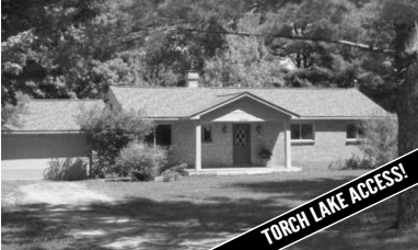
3680 N US 31 • KEWADIN Beautifully updated ranch with 44 feet of shared frontage on Torch Lake. Great year around home or Up North get away. MLS 440881. Ask for Mike Stark. $89,900