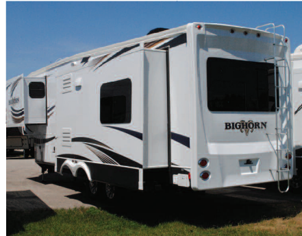
New 2014 Bighorn 3010RE Fifth Wheel

AS LOW AS $163 A MONTH SALEPRICE $19,995 SAVE $5,805