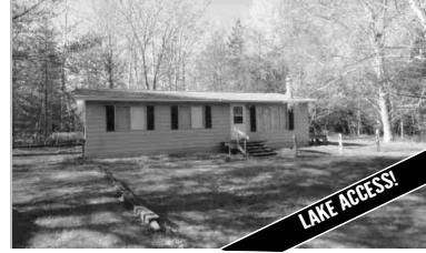
03653 COMMODORE DRIVE, EAST JORDAN Friendly community with private boat slips, sandy beach and family picnic area. Three BR, 1.5BA w/ Lake Charlevoix access! MLS 436953. Ask for Mike Stark. $84,900