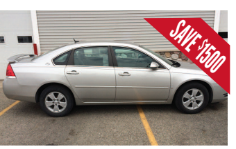
2008 CHEVROLET IMPALA Only 38,000 miles $12,495