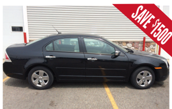
2009 FORD FUSION $8595