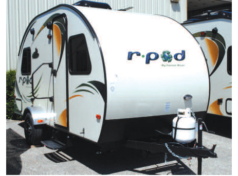
New 2014 R-Pod 171 Travel Trailer

AS LOW AS $424 A MONTH SALEPRICE $51,995 SAVE $23,673