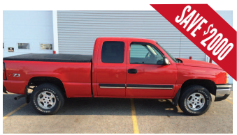
2004 CHEVY SILVERADO 1500 4X4 $10,195