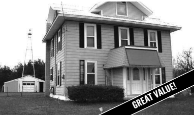
1075 N LIMITS STREET MANCELONA MLS 440360. This home has a lot to offer with 7 bedrooms and 2 1/2 bathrooms located just outside of the city limits. Ask for Holly Nierman. $99,900