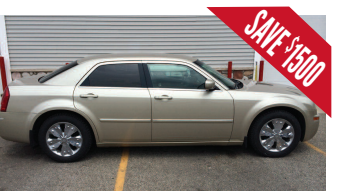
2006 CHRYSLER 300 TOURING $8,995