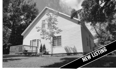
6556 CENTER, ELLSWORTH This home has been completely remodeled! Feature master suite, large kitchen w/bar and a beautiful fieldstone fireplace. MLS 441389. Ask for Jennifer Burr. $89,900