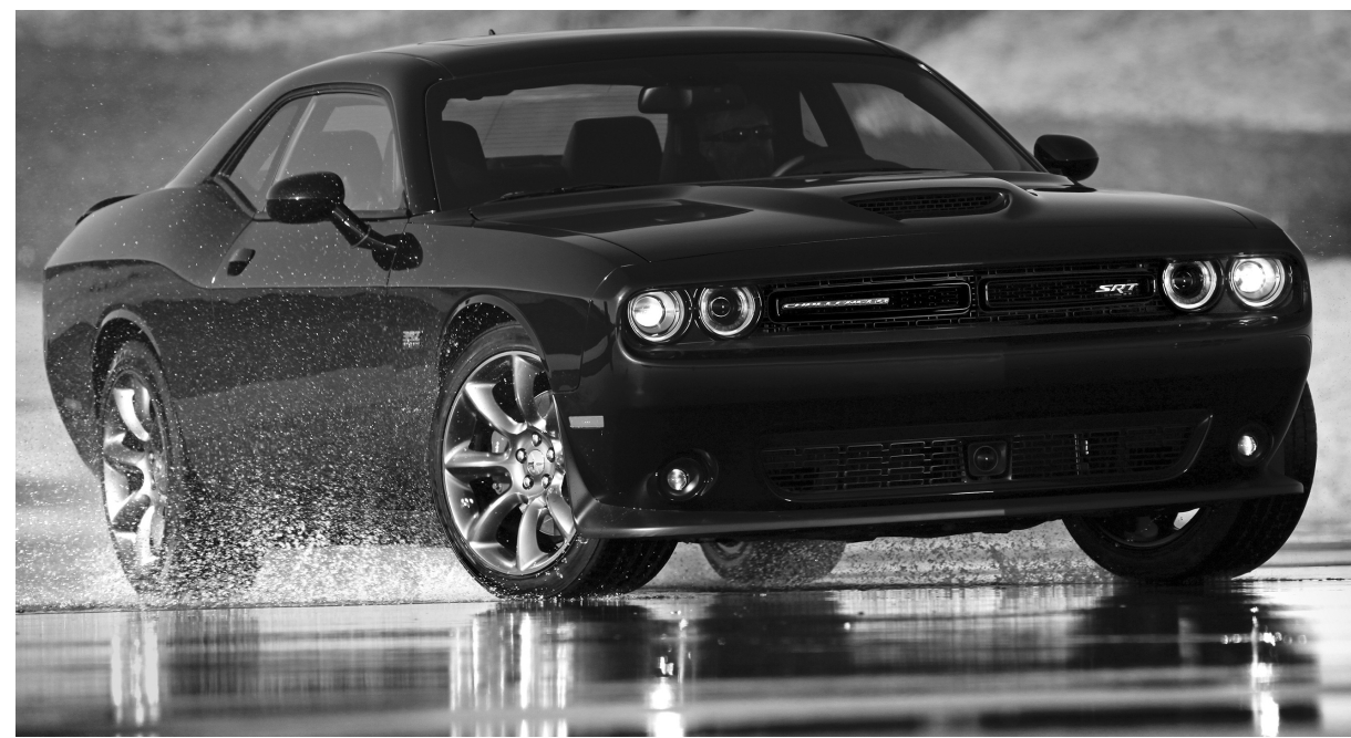
Power, efficiency and value are essential to maintaining powertrain leadership in today's new-vehicle market. Chrysler Group checks all three boxes - with authority - for model-year 2015, including the new 600-plus horsepower 2015 Dodge Challenger SRT with a Hellcat engine.