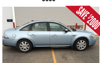
2008 FORD TAURUS LIMITED $7,995