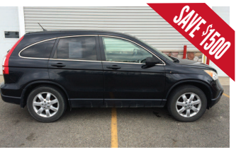
2004 HONDA AWD CRV $11,995